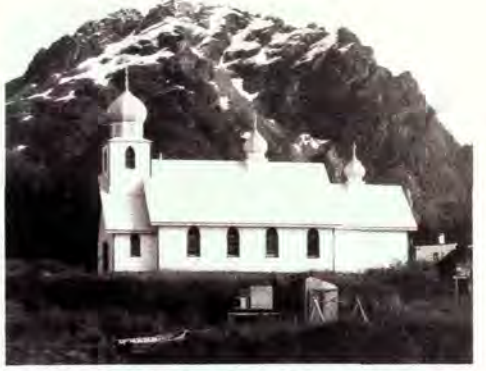
The church at Tatitlek, in front of Copper Mountain. Tatitlek is near the entrance to Valdez Arm.

Alaska Dept. of Natural Resources Resource Allocation Section P.O. Box 107005 Anchorage, Alaska 99510.