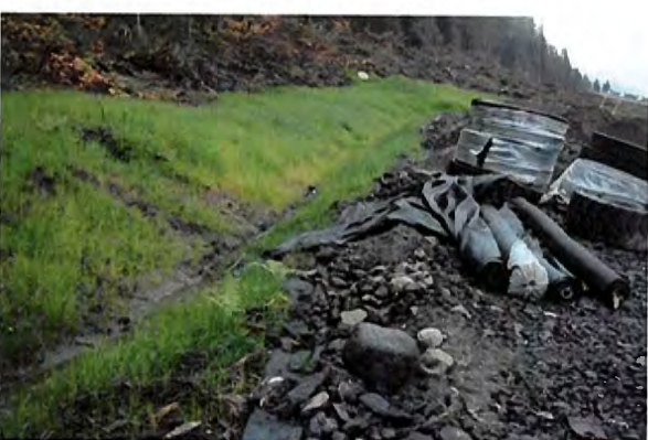
Run-on diversion at the East Ridge Stockpile Area