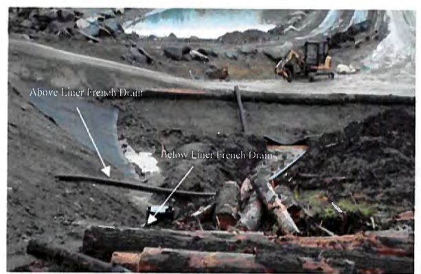
Drainage Layout North Termination ERE