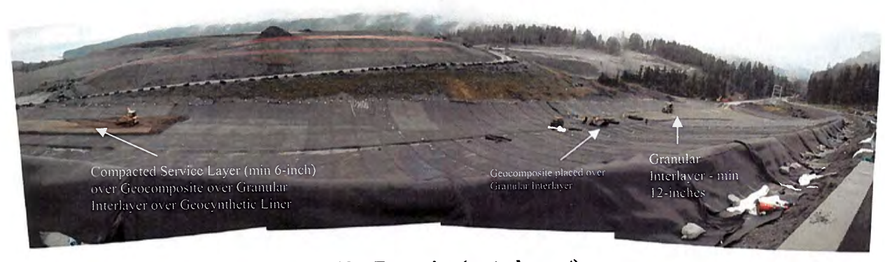
East Ridge Expansion (central aspect)