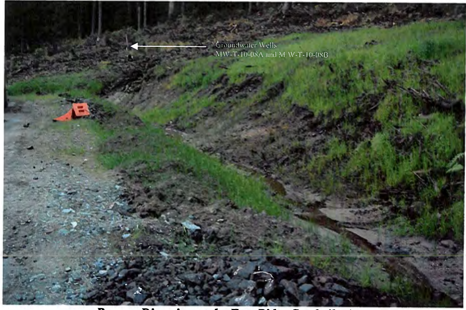
Run-on Diversion at the East Ridge Stockpile Area Note: Groundwater Monitoring Wells MW-T-10-08A and MW-T-10-08B