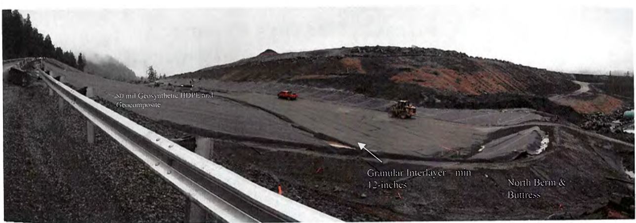
East Ridge Expansion (northern aspect)

grading and establishment of the ERE foundation, foundation drains, instrumentation, above and below liner drains took place prior to this visit. The construction report with as-built drawings will detail how this was performed. The installation of the liner was nearly complete at the time of this visit. The installation of the granular interlayer, poly-flex geocomposite and compacted sand service layer were observed and appeared to be carried out according to the above mentioned plan. HGCMC reported the URS QA/QC representative was not at the tailings disposal facility to oversee the installation of the liner system during this inspection but was onsite if needed.