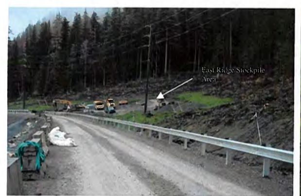
East Ridge Stockpile Area

The stockpile area was observed at this inspection. The area was used as a pad to stage equipment rather than to stockpile earthen material as originally planned. HGCMC developed a substantial upgradient run-on diversion ditch around the stockpile in order to keep water from entering the pad and to properly direct the flow of stormwater away from the area.