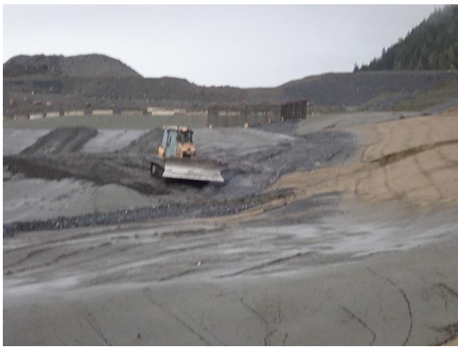
Photo 12. A bulldozer compacting tailings and contouring recently deposited tailings.