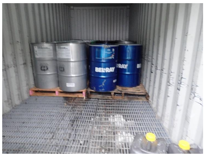
Photo 3. Petroleum products stored with appropriate secondary containment.