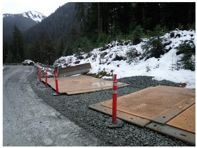
Photo 6. The location where geotechnical drilling will take place near the 7.4 B-road Bridge.