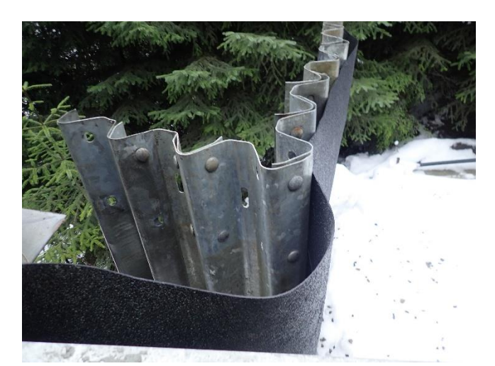
Photo 7. A steel wall was installed along the abutment to prevent erosion.