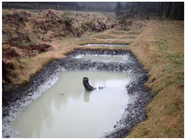
Photo 11. The series of BMPs for stormwater management near the 3.0-mile maker B road.