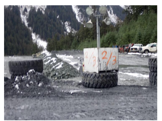
Photo 4. Site 23, where class 1 and class2/3 waste rock is to be stored.