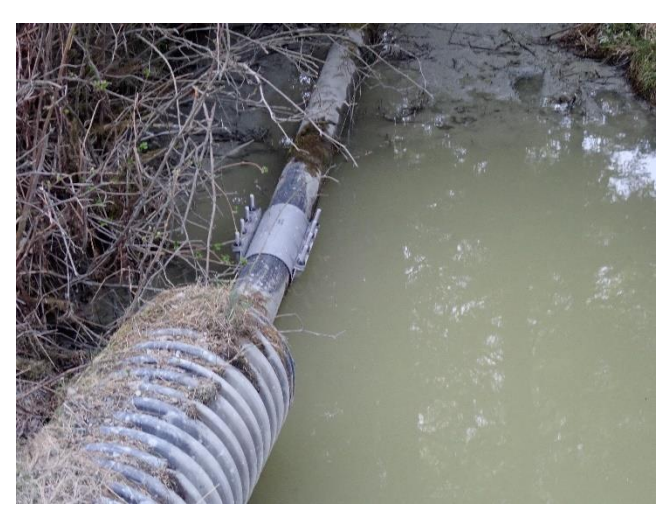
Photo 12. At Site E, a steel clamp was placed over the leaking section of the pipe.