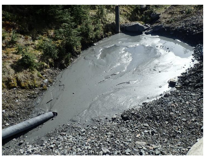
Photo 4. Sediment sump at the base of Ore Pad hill requires mucking.