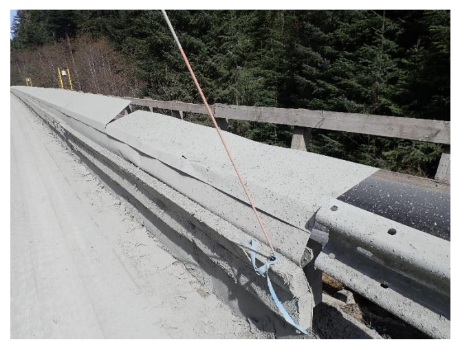
Photo 16. The damaged section splashguard requires repair/replacement.