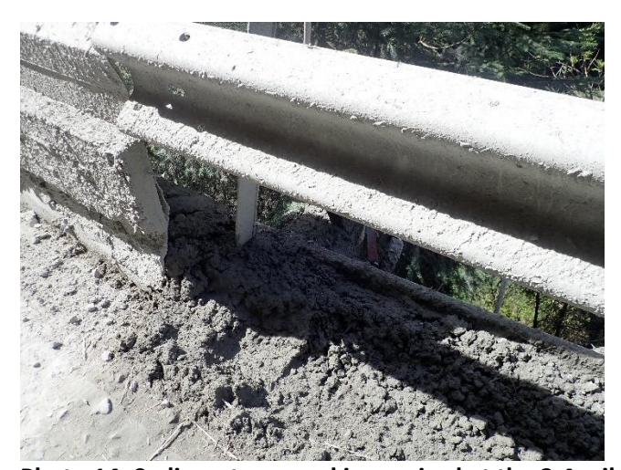
Photo 14. Sediment removal is required at the 3.4 mile B-road bridge ends.