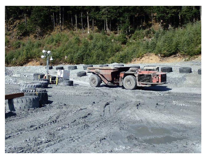
Photo 6. A haul truck depositing class 2 and 3 waste rock at Site 23.