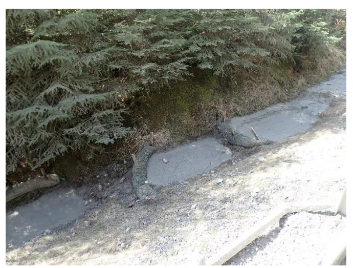
Photo 10. Sediment sump require mucking at the 7.4 mile B-road Bridge.