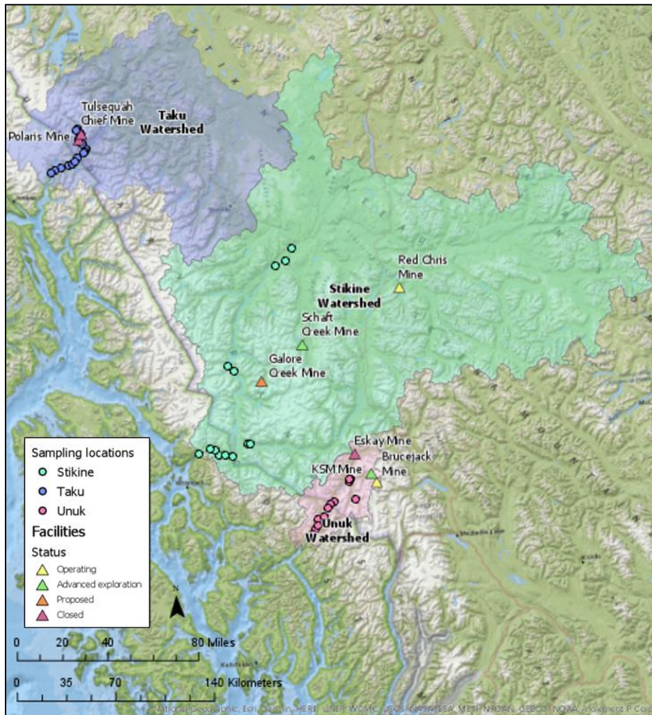
Figure 3. Joint Alaska–B.C. Transboundary Sampling Locations and Mining Activities

Resident fish species were sampled in each watershed for whole body element concentrations. Arsenic concentrations in Dolly Varden char collected in the Taku watershed in 2018 and 2019 were greater downstream of Tulsequah Chief Mine and New Polaris Mine relative to fish collected upstream in the Tulsequah River. However, when these data are compared to Dolly Varden data collected in this watershed over the last five years, results show that element concentrations in Dolly Varden have remained relatively constant both upstream and downstream of the Tulsequah Chief Mine. In the Stikine watershed, copper concentrations in sculpin were greater downstream of the B.C.–Alaska border while other elements were similar at all sampling sites in the watershed except for selenium in Alaskan sculpin samples. Selenium was lowest in these samples compared to other samples in the watershed. In the Unuk watershed, Dolly Varden element concentrations were lower in Alaska compared to the B.C. mainstem and tributary sites, including the South Unuk River, a sub-watershed with no mining activity. Dolly Varden samples from Sulphurets Creek, downgradient of the KSM deposits, displayed higher levels of copper relative to samples from elsewhere in the watershed. Despite some differences in fish element concentrations, identifying mechanisms responsible for these differences will require sampling designs that are more focused in area and scope than the objectives of this program.