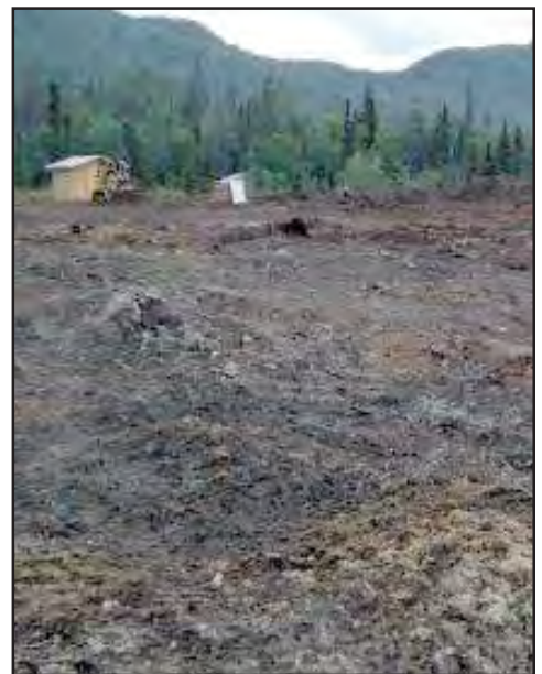
Planting site in Pedro Bay, cleared in 2011

Pedro Bay is a village of 50 residents located on the North East corner of Iliamna Lake. During the summer of 2011, the Rural Village Seed Production Project broke ground on two and a half acres set aside for the project. The crew has shut down for the winter, and is anxiously awaiting the spring to put finishing touches on the seed house and host a dedication ceremony for the new structures.