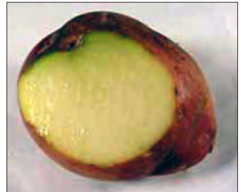
Unwanted greening can occur when potato tubers are exposed to sunlight or artificial lighting