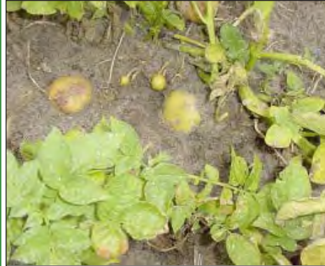
Potatoes can become sunburned when the hill of soil does not completely cover the tuber

The degree of greening and length of time before it occurs varies with temperature, the brightness of light and the thickness of the potato epidermis. In order to avoid sunburn before harvest, maintain a sufficient soil cover above the potato seed piece and keep the hill wide enough for new tubers to expand underground.