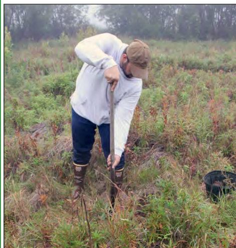
RVSP staff perform soil sampling in Aniak

Aniak project staff have been diligent in ordering parts and supplies and will be ready to get a good start with planting in the spring.