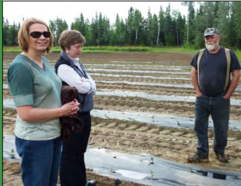
Representatives from the Department of Environmental Conservation and Division of Agriculture recently visited Borman farm in Delta Junction

Fairbanks School District Food Service, Division of Agriculture, and Department of Environmental Conservation (DEC). We started at the Borman Farm, where we were shown the greenhouse, fields, crops, and windmill set-up. We discussed questions and concerns related to direct product purchases and brainstormed solutions.