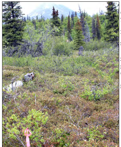
This site in Pedro Bay will be cleared and tilled, and used for planting revegetation crops