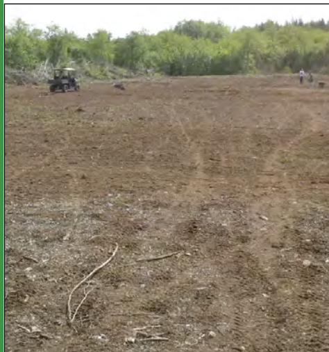
A planting site in Metlakatla is being prepared for planting of revegetation crops including Beach wildrye, Spike trisetum and others

For more information about the Rural Village Seed Production Project, please contact Brianne Blackburn, at (907) 745-8785, or Brianne.Blackburn@alaska.gov .