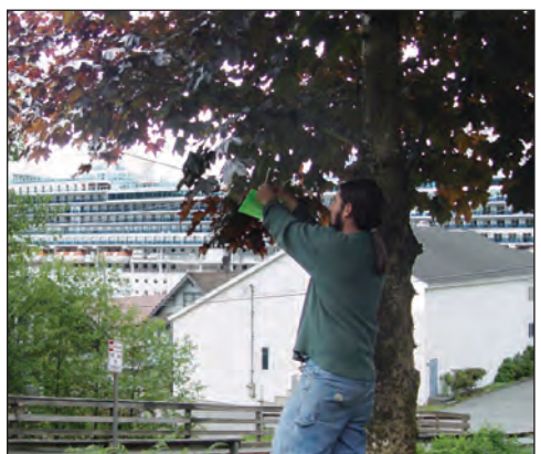
USFS Cooperator monitoring a trap in Ketchikan

Detecting these exotic moths early, before they become established, is crucial. The Division of Agriculture is cooperating with survey partners across Alaska in a concerted effort to deploy insect monitoring traps near high risk locations. This year, traps were distributed to partners representing the UAF Cooperative Extension Service (CES), U.S. Department of Agriculture (USDA), Animal and Plant Health Inspection Service, Plant Protection and Quarantine (APHIS-PPQ). Detection efforts target the European and Asian gypsy moth (EGM & AGM) Lymantria dispar (L.), Rosy gypsy moth, Lymantria mathura (Moore), Nun moth ( Lymantria monacha (L.)), and the Siberian Silk moth, Dendrolimus superans sibiricus (Tschetverikov). Targeting Pathways: Working Together to Prevent the Introduction of Gypsy moth in Alaska Early detection efforts to trap exotic pests often target pathways of introduction. The gypsy moth and other insect pests may enter Alaska by numerous pathways; hitchhiking on vehicles or shipping containers. Historically, EGM detections in Alaska have been in RV/recreational parks and AGM egg