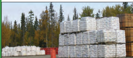
Shipping and Storage Yard

Early detection efforts to trap exotic pests often target pathways of introduction. The gypsy moth and other insect pests may enter Alaska by numerous pathways; hitchhiking on vehicles or shipping containers. Historically, EGM detections in Alaska have been in RV/recreational parks and AGM egg