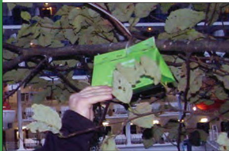
Placing a Gypsy Moth Trap