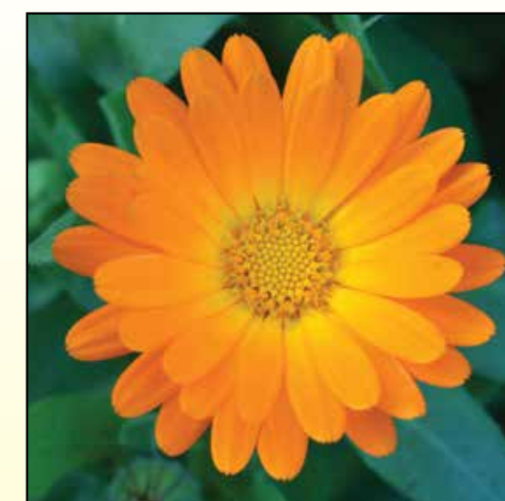
Pot Marigold ( Calendula officinalis )