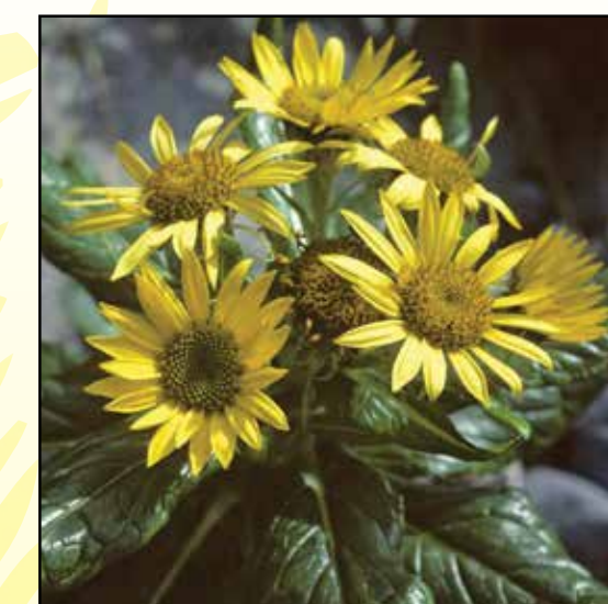
Beach Fleabane ( Senecio pseudoarnica )