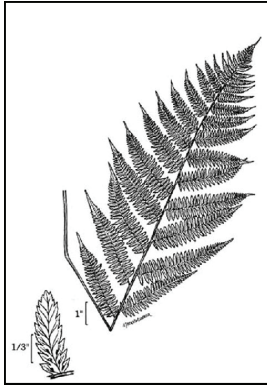
Lady Fern USDA-NRCS PLANTS

Family: Dryopteridaceae – Wood Fern family