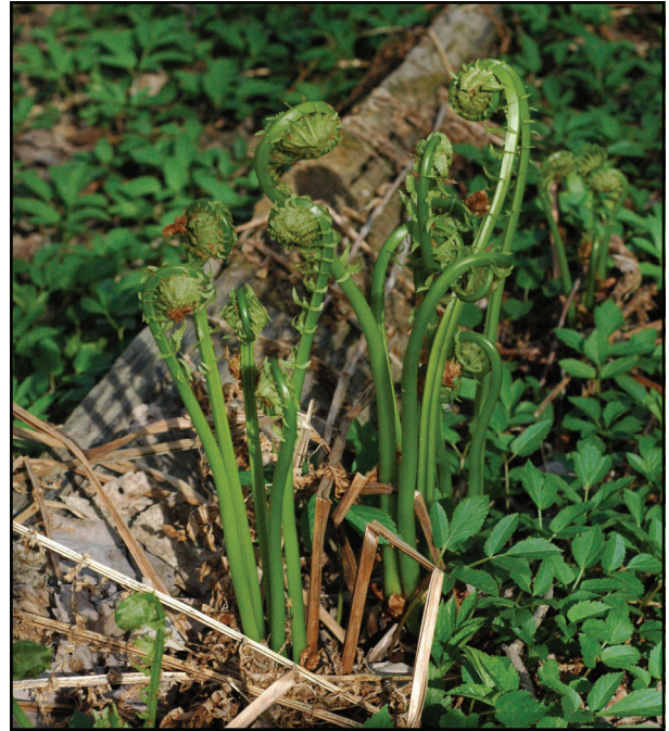
Ostrich Fern fiddleheads