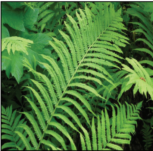
Ostrich Fern