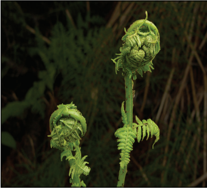
Young Lady Fern fronds

Upon emergence, both species of fiddleheads have brown papery scales which should be rubbed off before cooking. If the fiddleheads have fuzz instead of scales, it is not Ostrich Fern or Lady Fern.