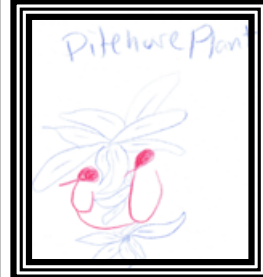
Sample artwork from Airport Heights Elementary School Students