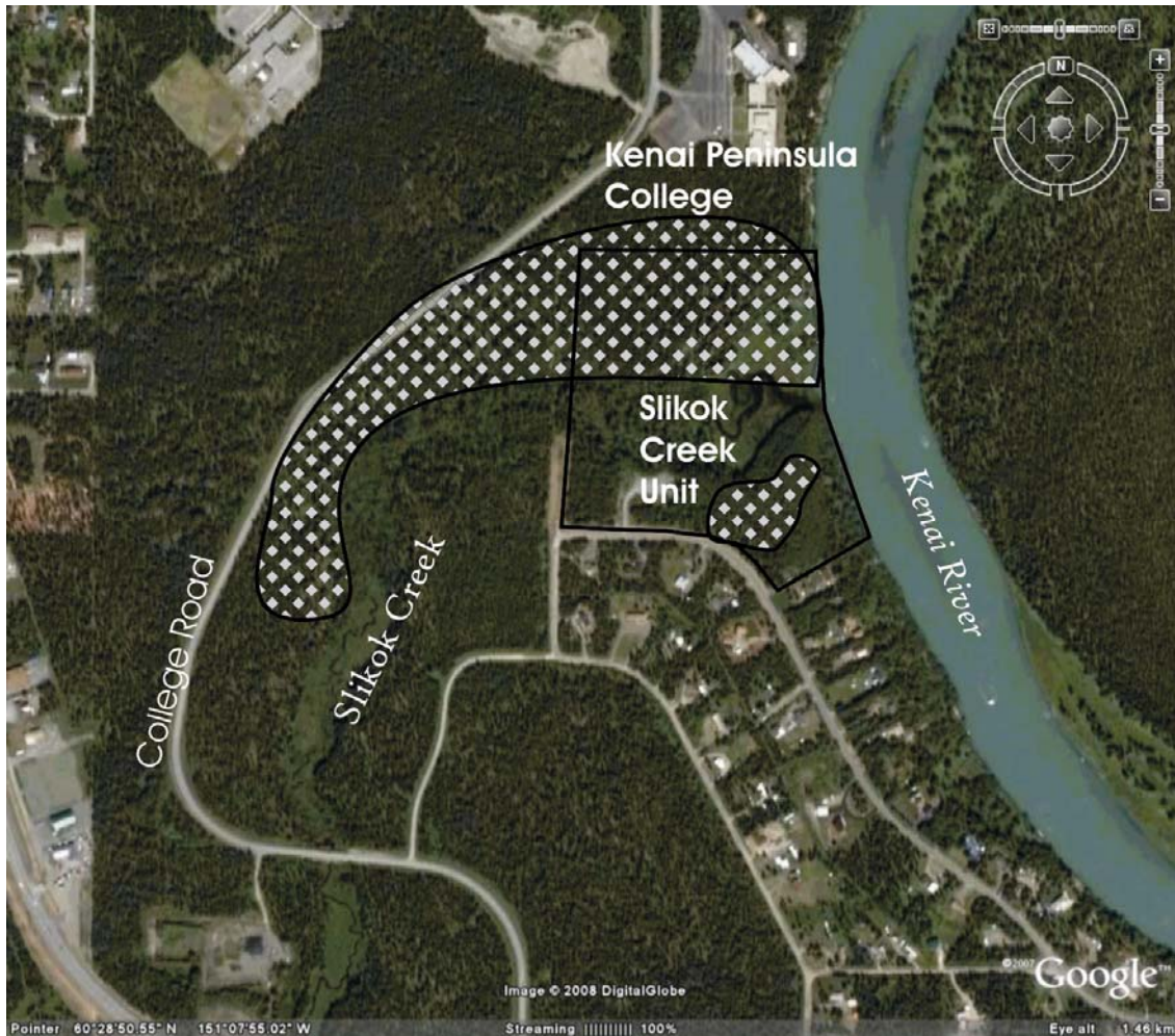
Figure 2. Patterned areas denote location of features for the prehistoric Dena'ina village at Slikok Creek.

intact deposits have a high potential to yield further information on subsistence and settlement of the late prehistoric Dena'ina. The Office of History and Archaeology has